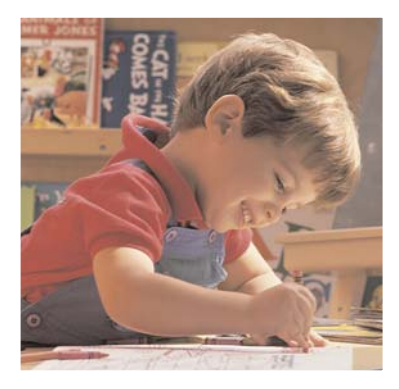
*Studies have shown that CaviCide liquid is nontoxic to humans

For the power of CaviCide in the convenience of a wipe, try CaviWipes disinfecting towelettes. For more information contact us at 800.841.1428 or visit us online at www.metrex.com.