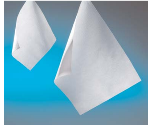
CaviWipes are now in 2 sizes: regular and extra large.