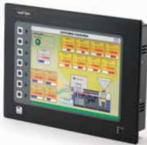
Red Lion G3 models are available in 3" mono, plus 6", 8", 10" and 15" color touchscreens.

When connected to a G3 HMI, Data Station Plus or Modular Controller, a panel meter can send alarm or event information via emails or SMS. And you can view data remotely using a web browser for real-time monitoring and control.