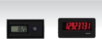
CUB3 Miniature 1/32 DIN CUB7 Miniature 1/32 DIN