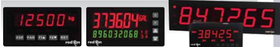
PAX 1/8 DIN Intelligent Meter Series PAX2 Dual Line 1/8 DIN Intelligent Meter Series LPAX/EPAX Large Displays