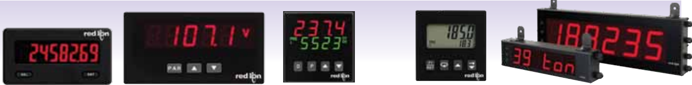
CUB5 Miniature Intelligent Meter Series PAX Lite 1/8 DIN Meter Series T48/P48 Miniature 1/16 DIN C48C/C48T Miniature 1/16 DIN LD Series Large Displays