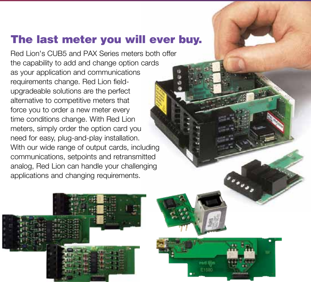
Change functions, add capabilities with plug-and-play, field-installable cards.

Red Lion's CUB5 and PAX Series meters both offer the capability to add and change option cards as your application and communications requirements change. Red Lion field-upgradeable solutions are the perfect alternative to competitive meters that force you to order a new meter every time conditions change. With Red Lion meters, simply order the option card you need for easy, plug-and-play installation. With our wide range of output cards, including communications, setpoints and retransmitted analog, Red Lion can handle your challenging applications and changing requirements.