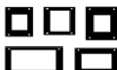
Panels and Adapters