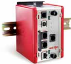
The Data Station Plus functions as both a data management platform and PFM host.

Extend the reach of Red Lion panel meters by connecting them to a G3 Series HMI, Data Station Plus or a Modular Controller. Share panel meter data with other devices by using one of the 200+ protocols and log panel meter data to an IT-ready file. Use pass-through programming to configure the panel meter remotely, then modify panel meter parameters if configuration changes are required.